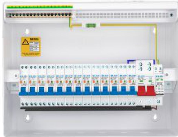
SRN Range Consumer Units – No Neutral Terminal Bar