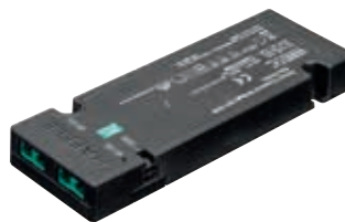
Loox5 Eco driver, 20 W