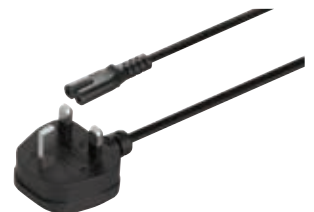
Loox mains lead