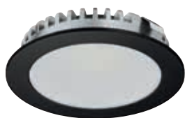
Loox5 LED 3094 spot light