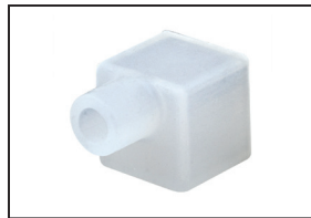
Live Ends ANS1010/LE/IP67