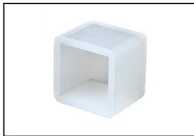
End Caps ANS1010/EC/IP67