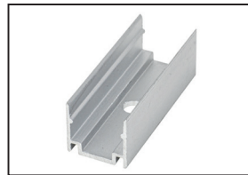
Mounting Clips ANS1010/MC

*Sold Separately. †Marine use will make guarantee 2 years. Do not use alcohol, chlorine, sulphur based chemicals on product.