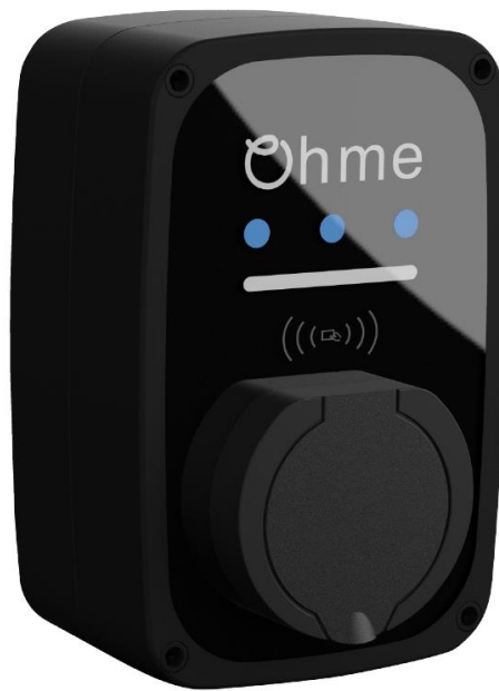
Figure 2 – Ohme EPod

They are fixed charging units primarily complying with product standard BS EN IEC 61851-1:2019 Electric vehicle conductive charging system, General requirements.