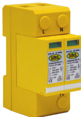
Part No. SY1C40X

Fully Compliant to BSEN61643-11, BSEN623005 & BS7671