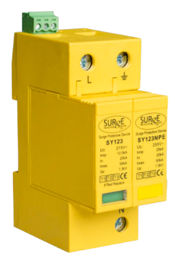
Part No. SY123/25KA2P