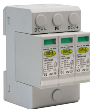
Part No. SPD PV600 600V DC

When we are looking protecting an installation against over voltage, we have to give some consideration to external cables entering the building. PV installations will come in to this bracket. SPD's for PV systems are to protect the inverter and the fixed installation, therefore PV SPD's should be installed on the DC side of the PV system, before the inverter. These will always be Type 2 devices, unless the building has an external lightning protection system and the correct separation distance to BSEN 62305-3 has not been maintained, where you would install a Type 1 SPD.