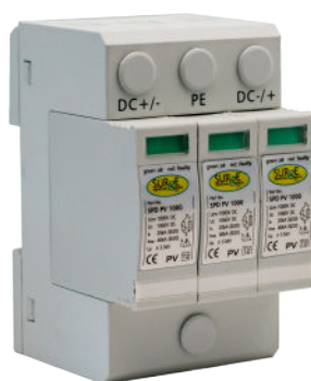
Part No. SPD PV1000 1000V DC