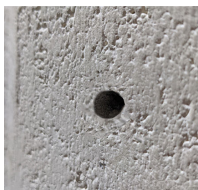
1. Drill a hole