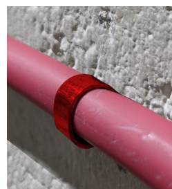
3. Push flush to wall