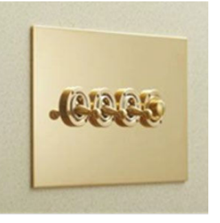
Dolly & Button Dimmer