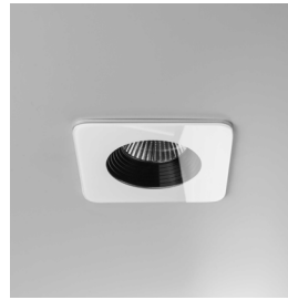
CODE: 1254014 FINISH: WHITE