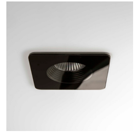
CODE: 1254017 FINISH: BLACK

TO MAINTAIN THIS PRODUCT TO ITS BEST CONDITION, PLEASE VIEW OUR CARE AND CLEANING GUIDE ON THE SUPPORT SECTION OF THE ASTRO WEBSITE.