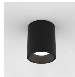
CODE: 1326068 FINISH: TEXTURED BLACK

TO MAINTAIN THIS PRODUCT TO ITS BEST CONDITION, PLEASE VIEW OUR CARE AND CLEANING GUIDE ON THE SUPPORT SECTION OF THE ASTRO WEBSITE.