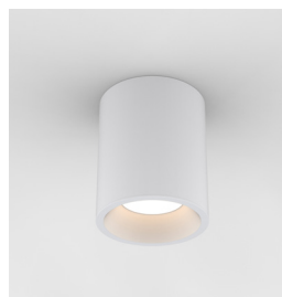
CODE: 1326067 FINISH: TEXTURED WHITE