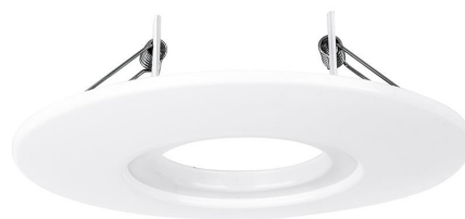
mPro™ and m10™ Adaptor Plate

Suitable for cutouts between 85-145mm. Requires AU-BZ600 bezel. Available in White, Matt White, Polished Chrome and Satin Nickel. Not suitable for use with adjustable versions of mPro™ and m10™