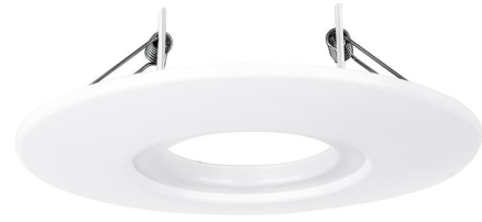
mPro™ and m10™ Adaptor Plate