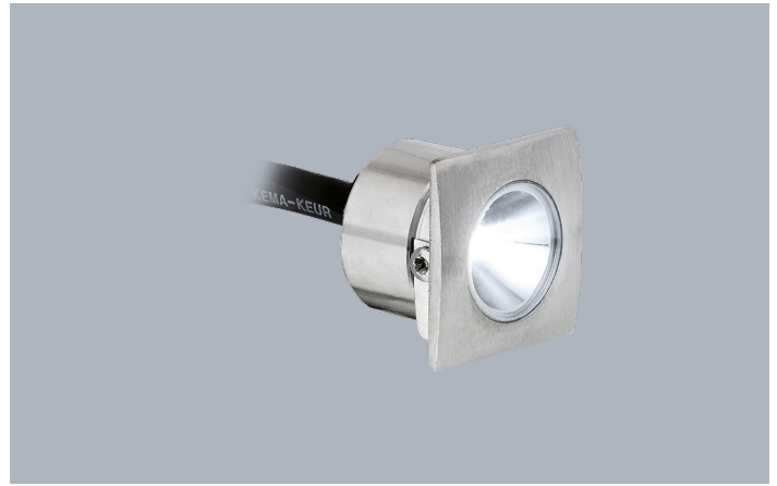
M-Lite™ PRO 1W IP68 Marker Light