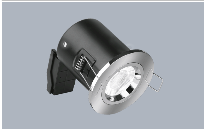
EFD™ GU10 Fixed Lock Ring Aluminium Fire Rated Downlight